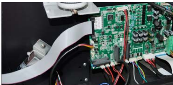
High quality board system

High quality and unlocked motherboard ensure stable printing and long life span.