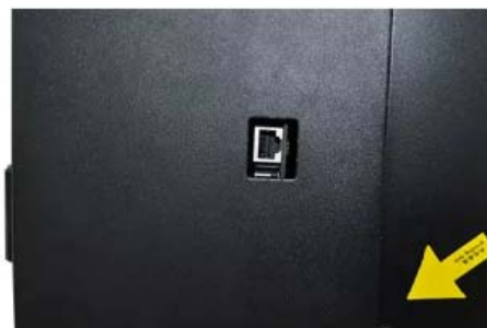
Network port transmission design

Chinese and English, one-click switching.