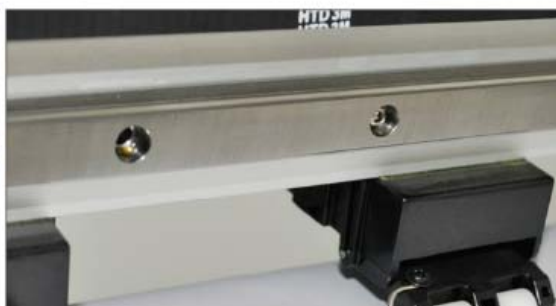
High quality guide rail

Anti-static platform design ensures that the paper feeding is straight and smooth.