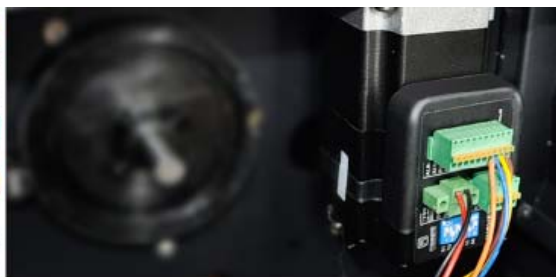
Original brushless motor

High quality and unlocked motherboard ensure stable printing and long life span.